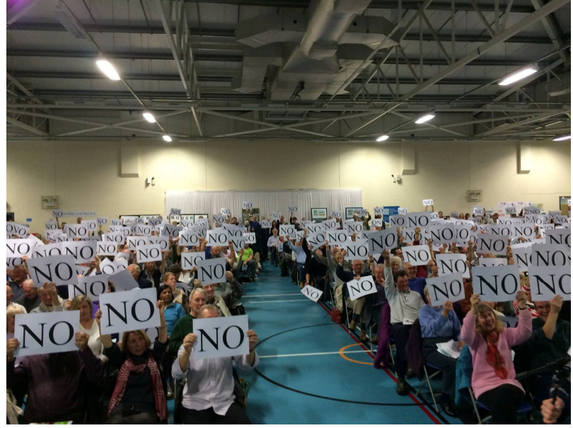
1,000 people said NO to a second runway at Gatwick (near London)

Plane Stupid Germany ask the Archbishop of Munich and Freising for his support in their fight against the 3<sup>rd</sup> runway in Munich